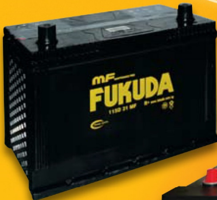
115D 31 MF